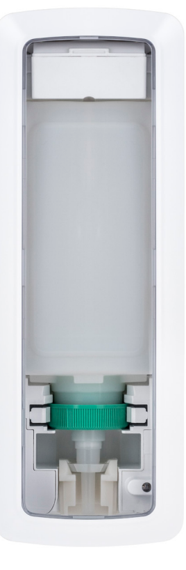
KX 750ml 4x C Batteries