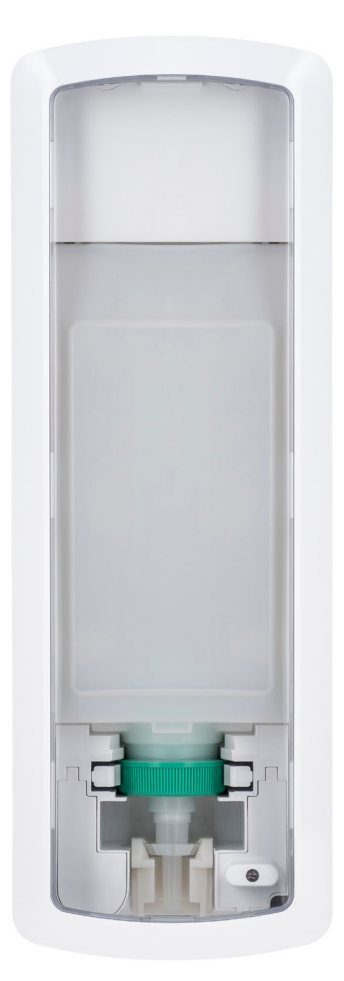
KX 1250ml 4x D Batteries