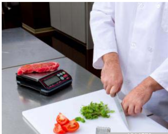
1814570 High Performance