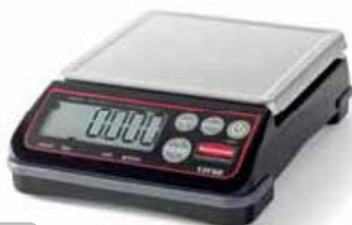
1814570 High Performance