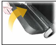
Flip Platform Up