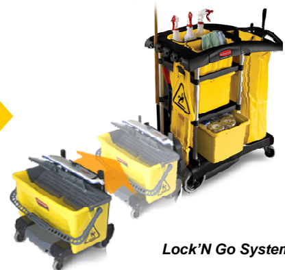
Lock 'N Go System